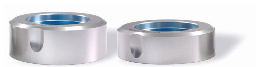
FIGURE 2: Side view of standard perforated lid with for 90 mm nutrient plates (right) and perforated lid for Growth Direct consumables (left) for the MAS-100 NT air sampler.

To accommodate them, MBV has adapted its perforated lid originally designed for 90 mm plates.