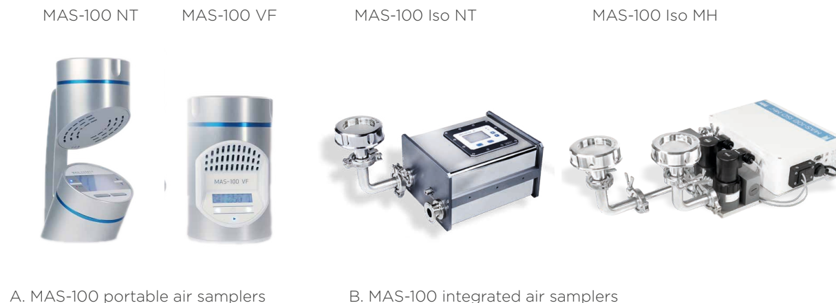
FIGURE 5: MAS-100 instruments compatible with the Growth Direct System. A. MAS-100 portable air samplers. B. MAS-100 integrated air samplers.

The following MAS-100 portable and integrated air samplers are compatible with the Growth Direct system: