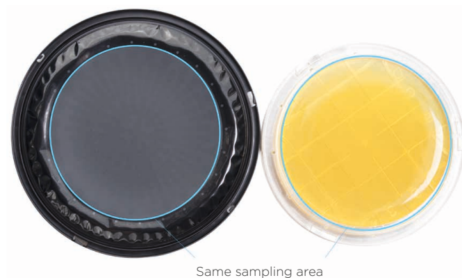
FIGURE 1: The sampling area of 55 mm contact plate (right) and of a Growth Direct cassette (left) have the same diameter.

The diameter of the sampling area of the Rapid Micro Biosystems Growth Direct cassettes is the same as that of a 55 mm contact plate (Figure 1).