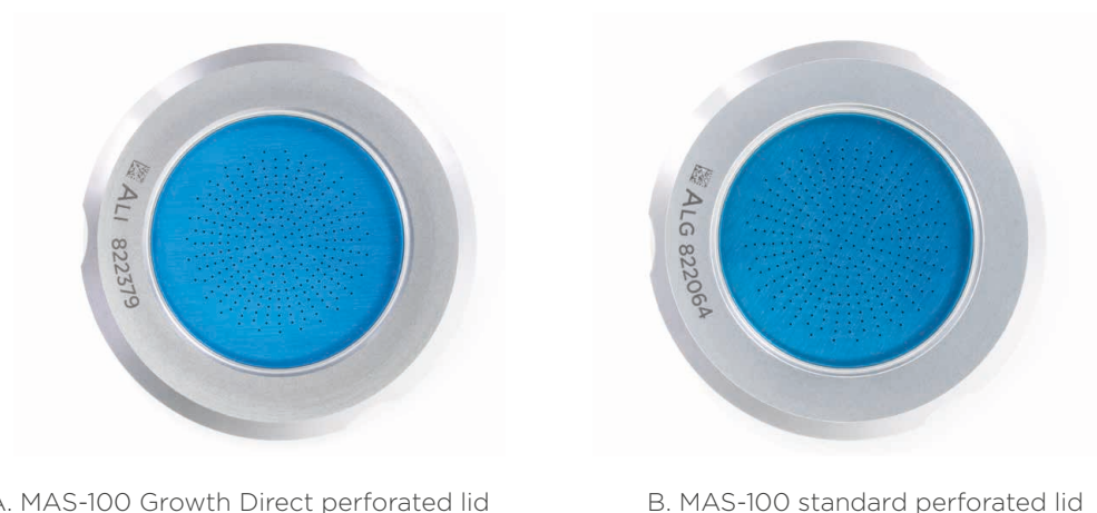
FIGURE 4: A. Growth Direct perforated lid for MAS-100 NT instruments compared to B. Standard perforated lid for 90 mm nutrient plates.

However, the pattern of the holes was adapted and is denser on the lids to be used with Growth Direct consumables, to match their smaller sampling area (see Figure 4).