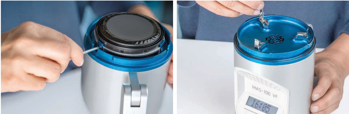
FIGURE 7: Demonstration of mounting Growth Direct clamps on MAS-100 NT (left) and MAS-100 VF instruments (right).

Specially designed clamps center and hold the Growth Direct cassette in place when used with the MAS-100 NT and MAS-100 VF portable instruments (Figure 7).