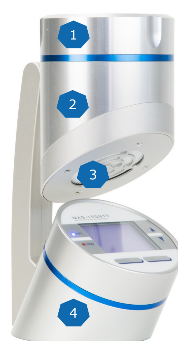
Figure 1 – MAS® 100 NT equipped with a H13 particle filter

We provide results on the cleanliness of MAS® 100 NT with and without in-built filters under several scenarios.