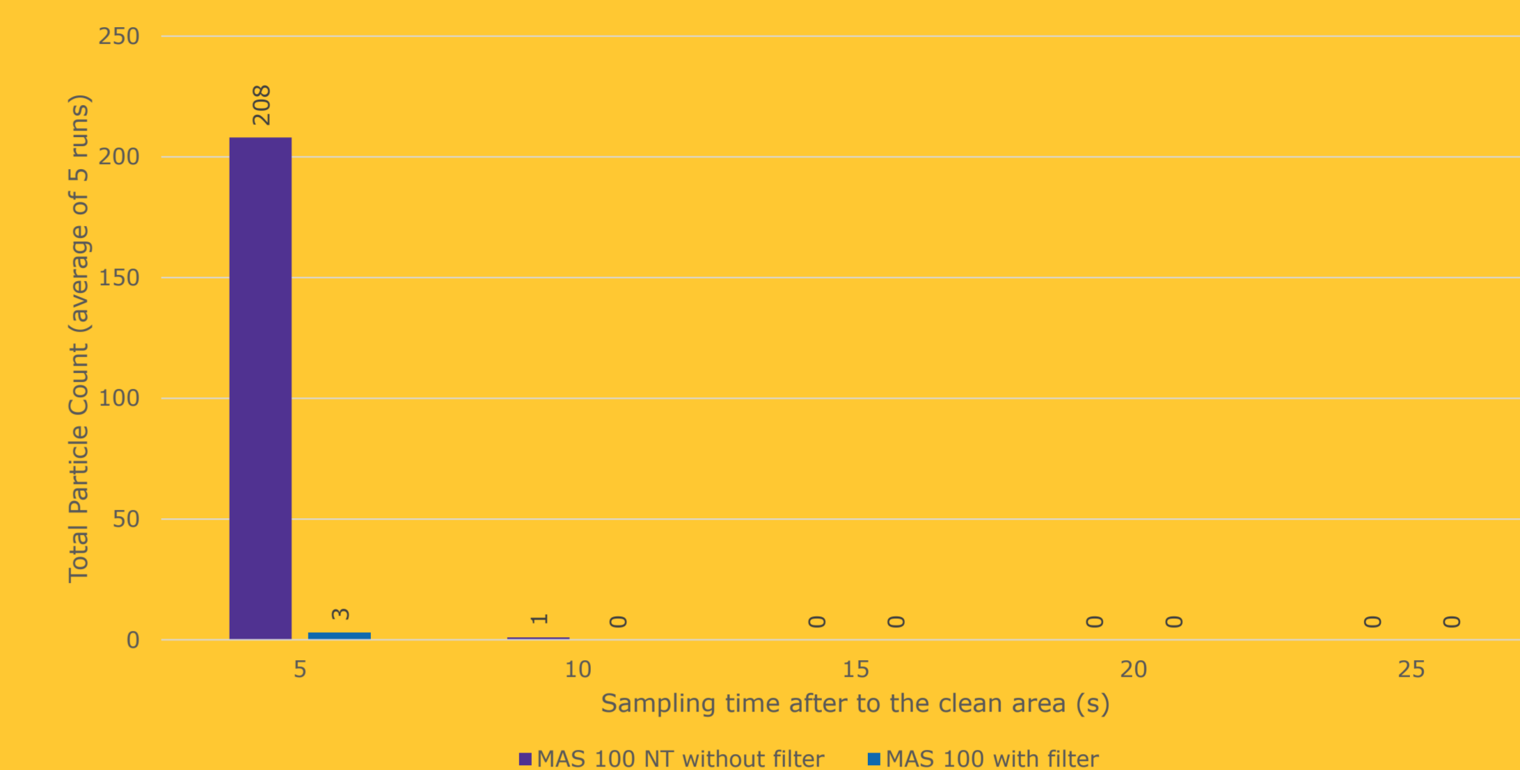
Figure 3: Transfer of particles from low to high contaminated to low contaminated environments